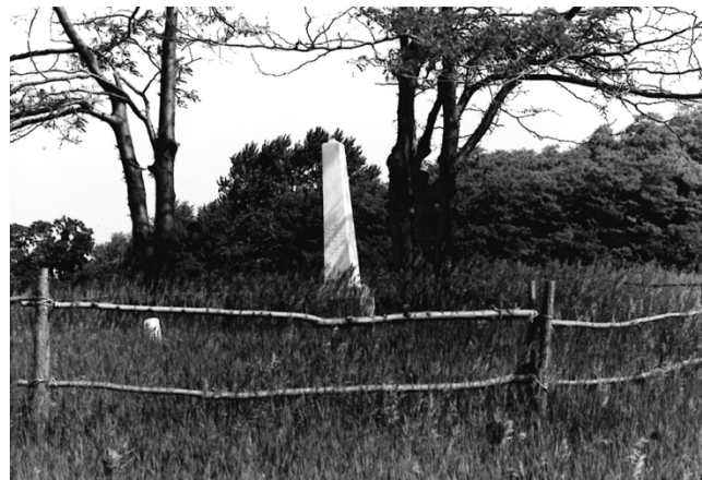
The locust trees and fence in September 1979. Both are long since gone.

The summer before the road was completed, 1979, 22 Youth Conservation Corps workers constructed a locust post fence around the cemetery as part of an eight-week summer conservation project. By 1979 there were two honey locust trees surrounding the two stones, 20 possibly left to grow by farmers and later SIUE groundskeepers who avoided clearing and mowing around the graves. It's also possible someone planted them.