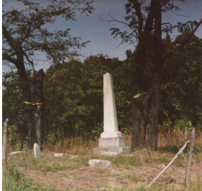
The cemetery on October 8, 2001, showing the yellow nylon straps on the trees and the dilapidated fence.

Every day the wind tears at it, shifts it slightly, working at its foundation. The stones tilt a little more, and every drop of rain tears at the stone, destroying the record the carved letters provide. 21