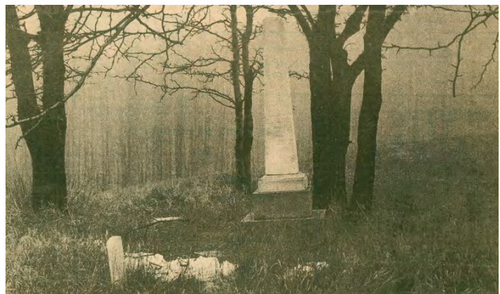
The earliest known photograph of the cemetery, taken in February or March 1979 before the fence was put up that summer. Taken by an unknown Alestle photographer. 17

The gravesite began to receive more attention as more people were coming to the newly built SIUE campus, which first opened for classes in the fall of 1965. 16 In October of 1967, members of the Kappa Delta Tau fraternity at SIUE made the first recorded discovery of the cemetery, though they were not the first to find the site. One of the fraternity members heard a