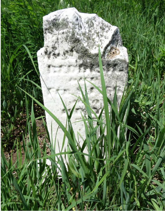
The Reddish grave with its top damaged. Photo taken May 12, 2015

Likely the most peculiar, and most tragic, part of the Whiteside cemetery is its second marker. It reads: