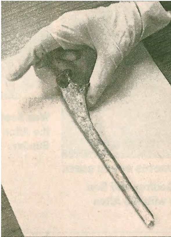
The arm bone discovered at the Whiteside Cemetery in 2003 as printed in the St. Louis Post-Dispatch . 30

mowing. However, workers still mow a strip up to the old cemetery from the appropriately named Whiteside road. 27