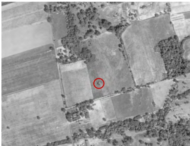
This segment of an aerial photograph taken August 31, 1941 shows the likely location of the gravesite in a red circle. 15