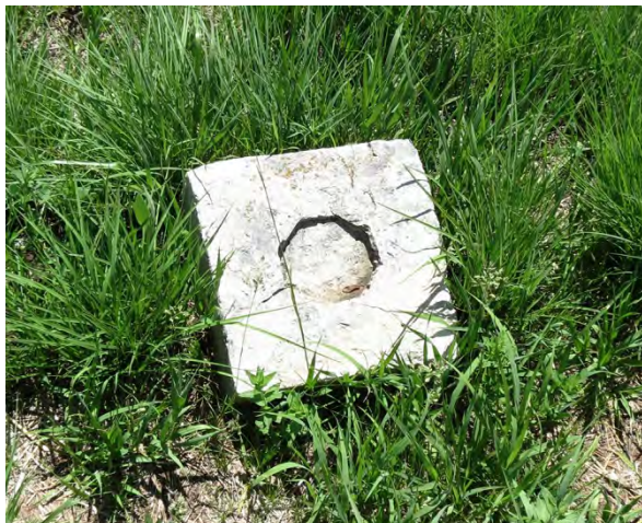
One of the other stones in the cemetery with an octagonal indentation. Photo taken May 12, 2015.