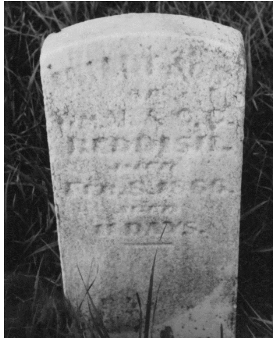
The Reddish grave with an intact top. Photo taken September 1979 by William R. Whiteside.

In any case, the Reddish gravestone is deteriorating faster than the obelisk. In 1979 the curved top was still intact. By 1984, the top was "splintered and broken." 9